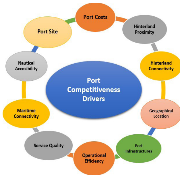
Figure 2. Drivers of port competitiveness [24] .

model of port governance [18] . Port governance always increased the port's effectiveness and competitiveness in the change of port management. The change in governance structures constitutes an important pillar in view of the achievement of sustainable development of ports including economic, social and environmental challenges. A port that was denoted as major engine for driving economics is a significant lever for governance to manage trade and catch economic benefits nicely [25] . With enormous containerization of maritime cargo, the container port industry is very competitive in serving the hinterland by filling all kinds of demands where South Asian countries' port tariffs are reasonable, but associated cost or indirect costs with the port tariffs are very high where inefficiencies play a more significant role in shippers' port choices [15] . Extension of ports often failed due to the lack of attention to the potential negative environmental impacts [8] .