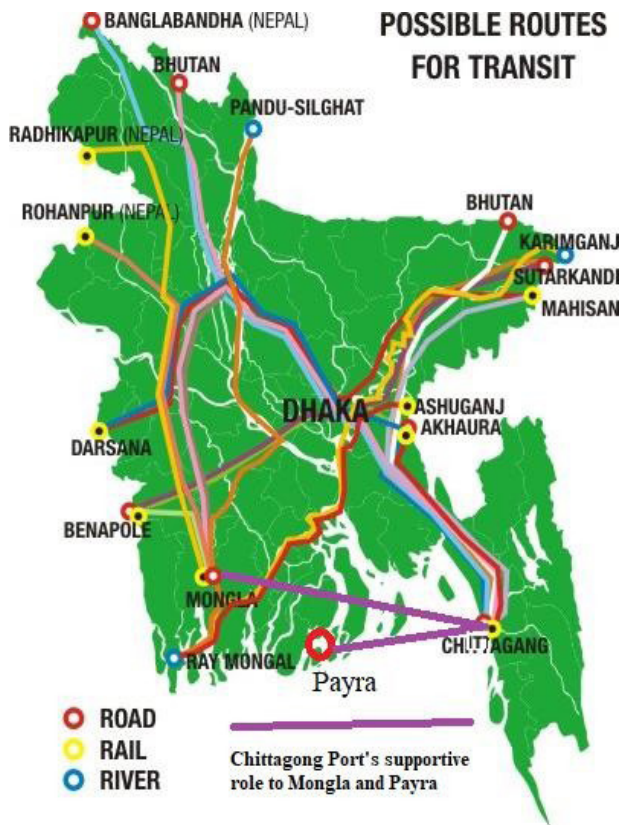
Figure 3. Inland transport connectivity and the role of Chittagong Port as a development partner of other national port Mongla and Payra [30] .

Overall, all respondents discussed that the integration of all seaports leading by Chittagong Port will make a chance to provide transit facilities to the neighbours by rail, road and river. In addition, CPA will finance the inland connectivity infrastructure cost where a good port transport network will be developed and respondents were optimistic about the process of port development. Mention that this transit issue is forecasted as derived demand of using Bangladeshi seaports, especially by India, Nepal and Bhutan [30,35] as per Figure 3.