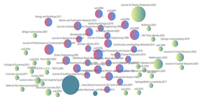
Figure 2. Related literature co-occurring network.

4) Data Analysis: Analyses were performed using text mining tools and techniques with keyword extraction and topic construction [11,12]. The co-occurrence network in Figure 2 shows the main articles, with pink representing classic papers, green representing core papers, and cyan representing key papers. LDA analysis shows the current hot topics in marine building disaster prevention.