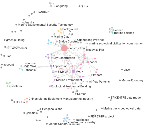
Figure 3. Keyword co-occurrence network.

In this study, the metadata was extracted with the help of WeiCiYun® with a total of 283,262 words, a size of 276.62 KB, 1296 valid entries, and 42,785 total words. Among them, the number of feature words is 1934. In this study, the first 50 keyword proper nouns are selected for co-occurrence, and the results are shown in Figure 3. Different colors in the graph represent different clusters [44]. The lines between each circular node represent the connection between each keyword. The size of the nodes also reflects the frequency of the keywords. The greater the frequency, the larger the diameter of the node [43].