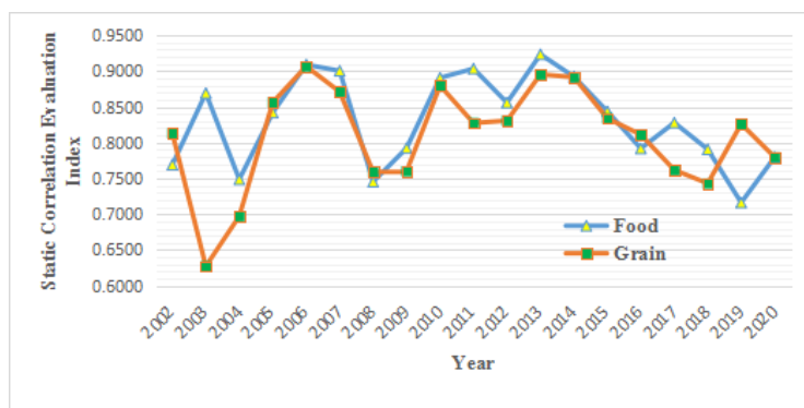
Figure 2. Static evaluation of the correlation between agri-food systems and resources integration.

Figure 2 displays the annual static correlation evaluation index from 2002 to 2020. Overall, the annual static correlation evaluation index of grain growth is similar to that of food growth, and the difference between them is not significant. However, there are two particular years. One is in 2003 when the evaluation index of grain growth decreased, the evaluation index of food growth increased, and the difference between the two was very large. The other is 2019, where the situation was the opposite of that in 2003. The reason for the difference in 2003 may be the result of China's comparative advantage in agriculture being reversed [29] . According to the World Trade Organization (WTO) caliber, China's agricultural trade was in an international surplus until 2003, after which it turned into a persistent deficit [30] . In 2003, China's industrialization reached the mid-stage, and its comparative advantage had been established in the international division of labor. A large amount of agricultural land was occupied, marking