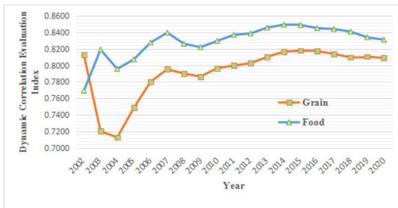
Figure 3. Dynamic evaluation of the correlation between agri-food systems and resources integration.

The impact mechanisms of the six categories of agricultural resources on the agri-food systems are different. Factor resources directly affect food production, while related industrial resources help food production from the upstream and downstream aspects. Demand resources allow for the distribution of final food products, while organization resources influence food production efficiency. Government resources regulate the allocation of food production resources, and opportunity resources affect food production from the perspective of uncertainty [31] . In the specific impact pathways and processes, the impact of factor resources and related industrial resources is relatively clear. However, the impact of demand resources, organization resources, government resources, and opportunity resources is relatively vague or even unknown. Therefore, the mutual relationship of the agri-food system composed of agricultural resources is extremely complex. It is difficult to clarify the logical relationship between various impact mechanisms and it belongs to a typical gray area. Some scholars have attempted to use the theory of complex system co-evolution to study the relationship between water resources, energy, and food systems without involving economic and political factors [32] . However, the scope of resources in this paper is much larger, and the interweaving of known and unknown relationships is more