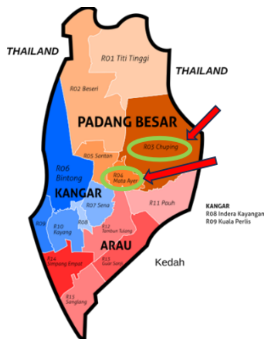
Figure 2. Geographical location of Mata Ayer and Chuping in Perlis, Malaysia.

naire and face-to-face interviews. The questionnaire was divided into several sections, including socio-demographics, inefficiency determinants, as well as farm input and output data.